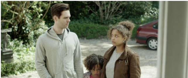
FIRSTBORN (2016): MOVIE REVIEW