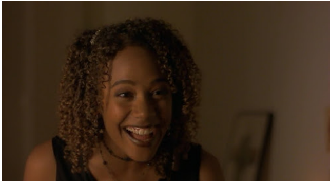
20 YEARS OF THE CRAFT: WHY WE NEEDED MORE OF ROCHELLE