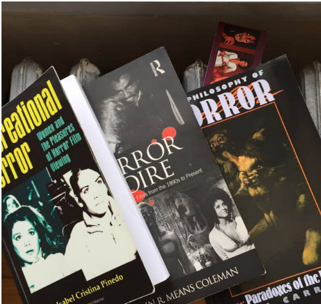
LIFE AS A #HORRORBLACKADEMIC: MY FIRST SYLLABUS