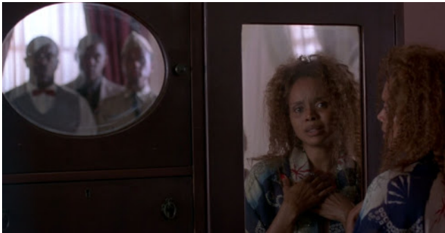
TERROR & HORROR: EVE'S BAYOU AS A REVERED BLACK WOMEN'S GENRE TEXT