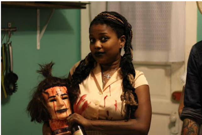
AUDRE'S REVENGE FILM COLLECTIVE